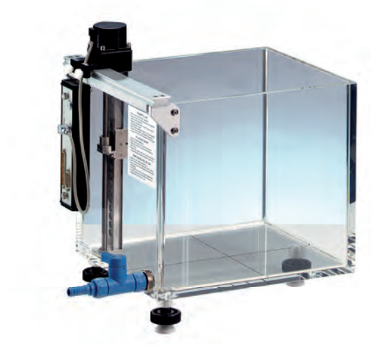
MP1 1D Water Phantoms (T41019/T41025) for reference dosimetry and measurement of depth dose curves, motorized or manual