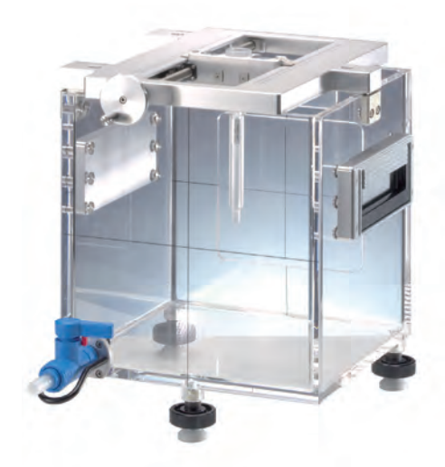
Stationary Water Phantom (T41023) for reference dosimetry with horizontal beam incidence