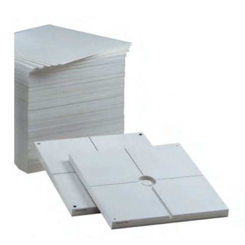
RW3 Slab Phantom (T29672) water-equivalent for therapy dosimetry