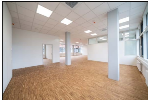
Photo 2: Switching between quiet work rooms and project niches – in addition to exchange, the office rooms also provide opportunities for retreating to private spheres