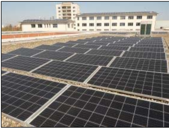
Photo 3: The PV system, which PTW had installed in the former Haufe building, supplies up to 100,000 kilowatt hours (kWh) per year